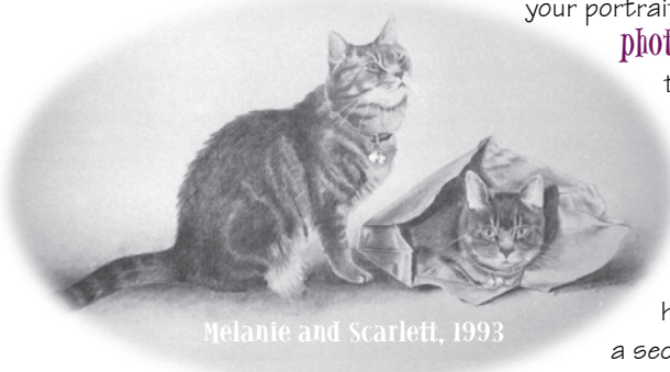
Melanie and Scarlett, 1993

Portraits start at $100.00 for a black and white 8"x10", and $125.00 for a color 8"x10". I reserve the right to limit the content according to the finished size.